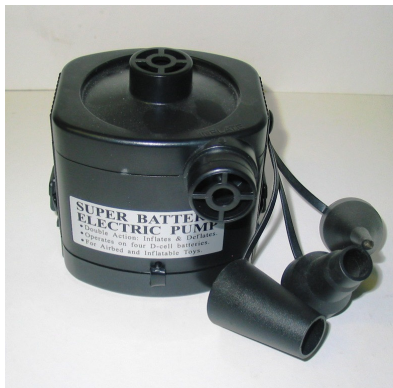
19020AC InstaFlator & Adapters

Your new Solstice Home Resort Series product features the “Insta-flate” system. This system allows you to quickly and easily inflate and deflate your float. The system combines our “19020AC InstaFlator” (4)“D” Cell battery operated pump with our “InstaValve”. The “InstaFlator” inflator / deflator features nozzle adapters which will connect to any of the 2 different valves on your float and can be used on many other inflatable products as well.