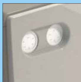
High & Low Refrigerant gauges