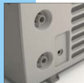
Plumbing can be connected either side