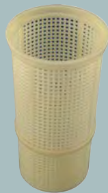
Heavy-Duty CMP Leaf Trap Basket 27182-010