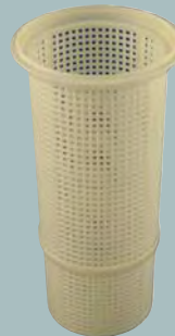
Heavy-Duty Leaf Trap Basket for HWD & Rainbow Traps 27182-020