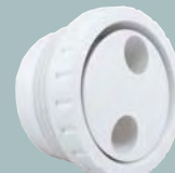
Deluxe Rotating Massage Jet 23315-030