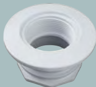
Wall Fitting 25523-100